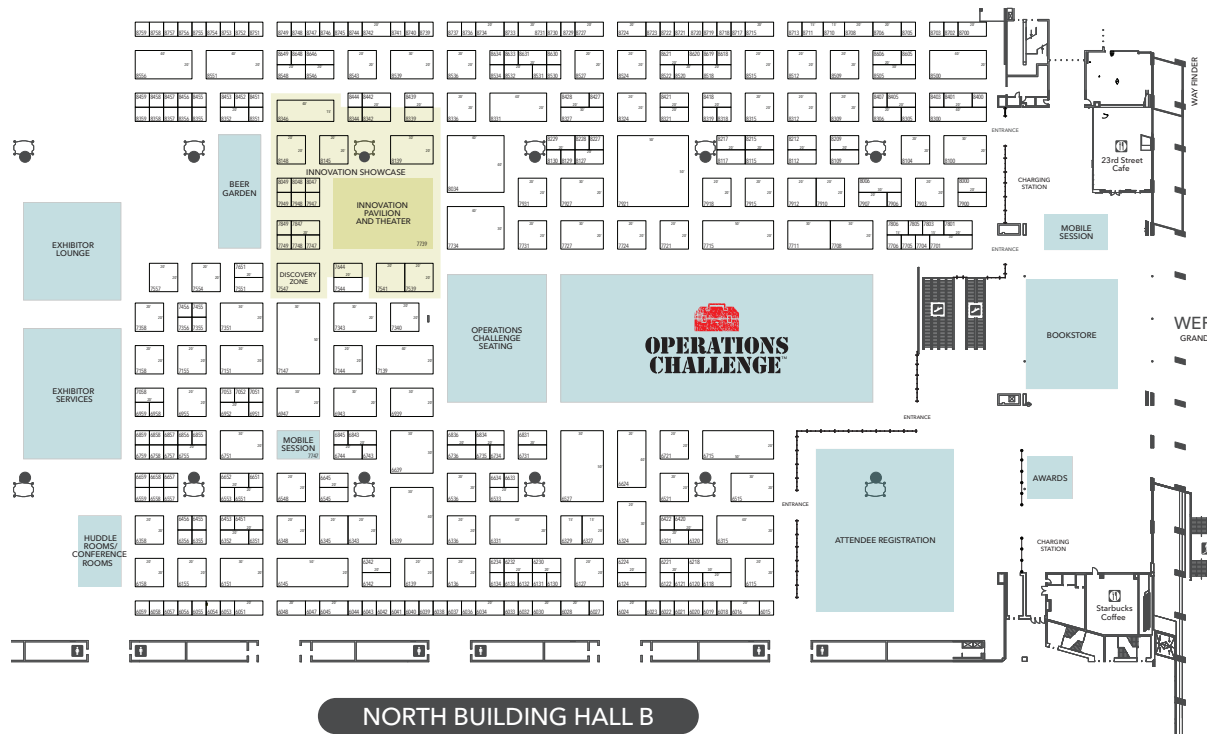
NORTH BUILDING HALL B

Imperial Industries, Inc. Inductive Automation Induron Coatings Inc. Industrial and Environmental Concepts Covers Industrial Test Systems (ITS) Infiltrator Water Technologies InfoSense, Inc. Infra Pipe Solutions LTD Inland Pipe Rehabilitation Innovyze Inovair Blowers Integrity Municipal Systems International Products Corporation International Valve Marketing LLC INVENT Environmental Technologies Inc. IPEX USA LLC Ishigaki USA Ltd. Isle Utilities ITC, S.L. IWAKI America J & S Valve, Inc. JCB Power Systems Limited JCM Industries, Inc. JCS Industries Inc. JDV Equipment Corp.