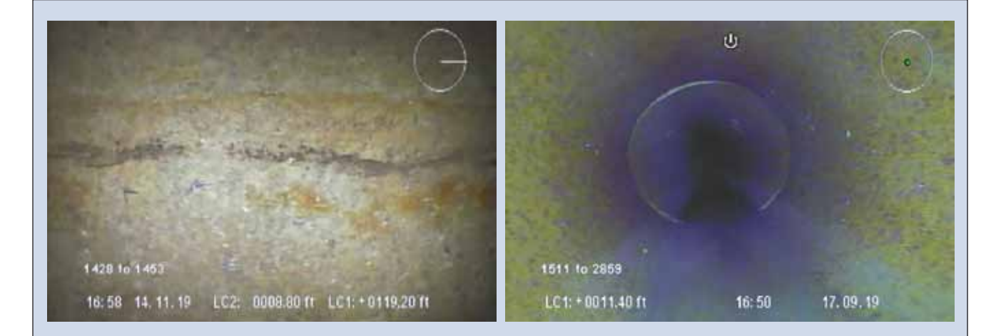
Figure 2. AI Approach to Pipeline Assessments

By combining two computer vision AI systems, operators can see whether the inspection camera is in a manhole or a pipe.